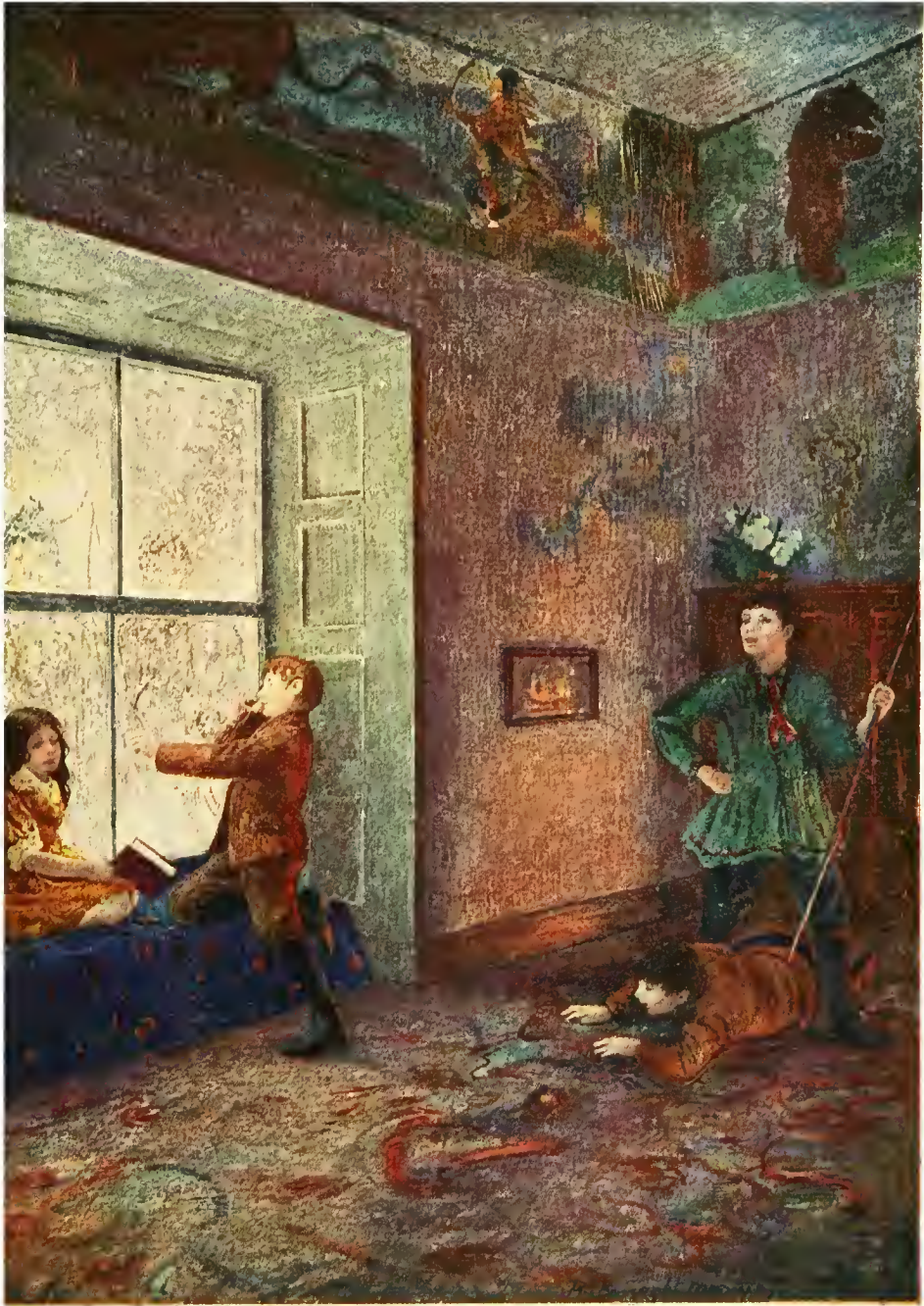
"MEANWHILE CHARLOTTE AND I CROUCHED IN THE WINDOW SEAT, . . ."